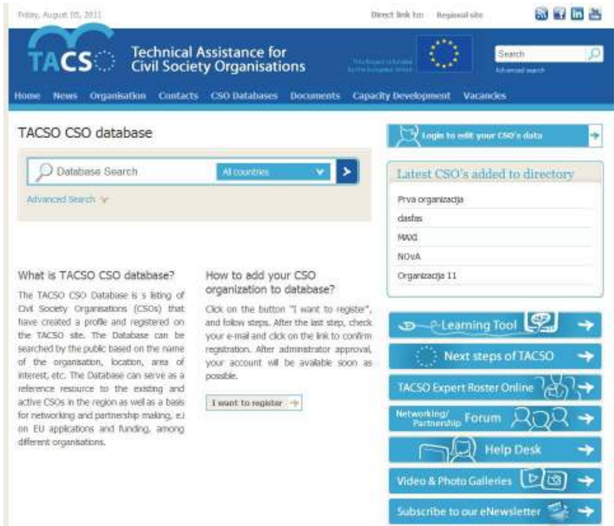
Figure 1 - CSO home page

A public user visiting the site has option on a CSO home page to open a registration web form. In the Figure 1 is shown button “I want to register”.