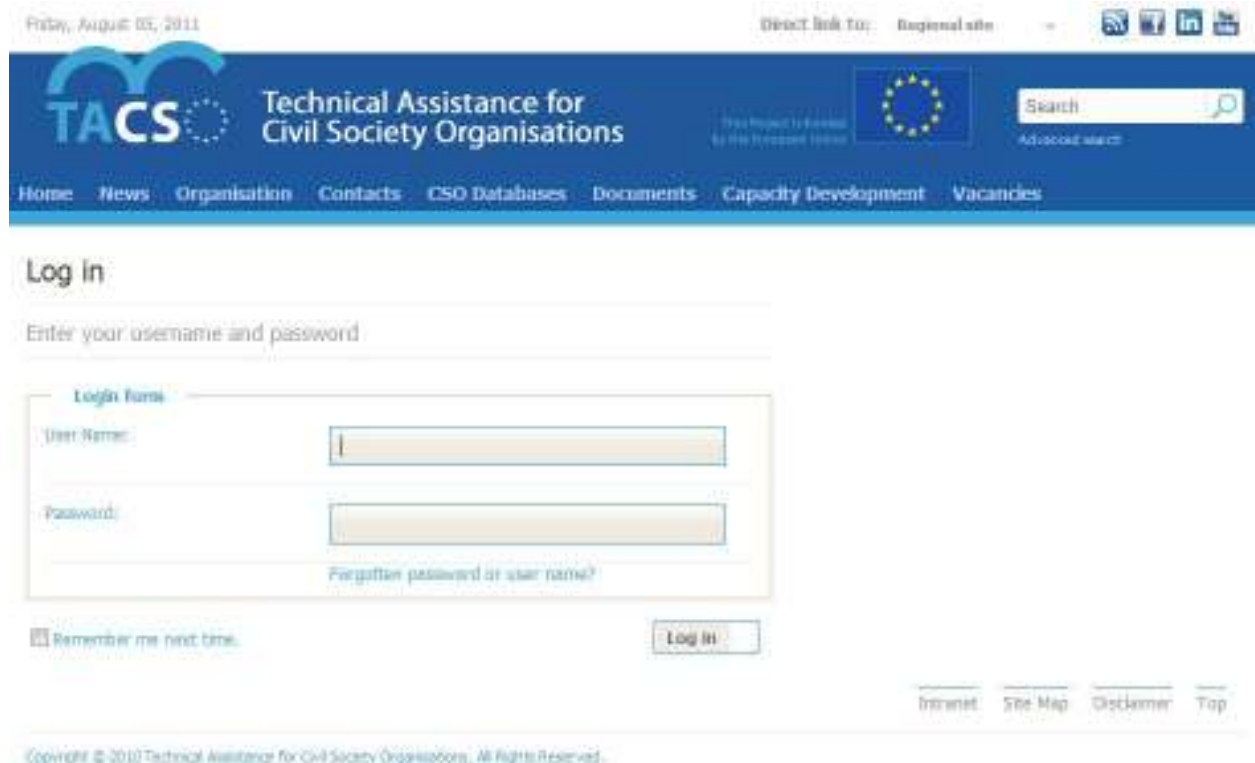
Figure 5 -Login page

In the Figure 6 is shown case when credentials are invalid.